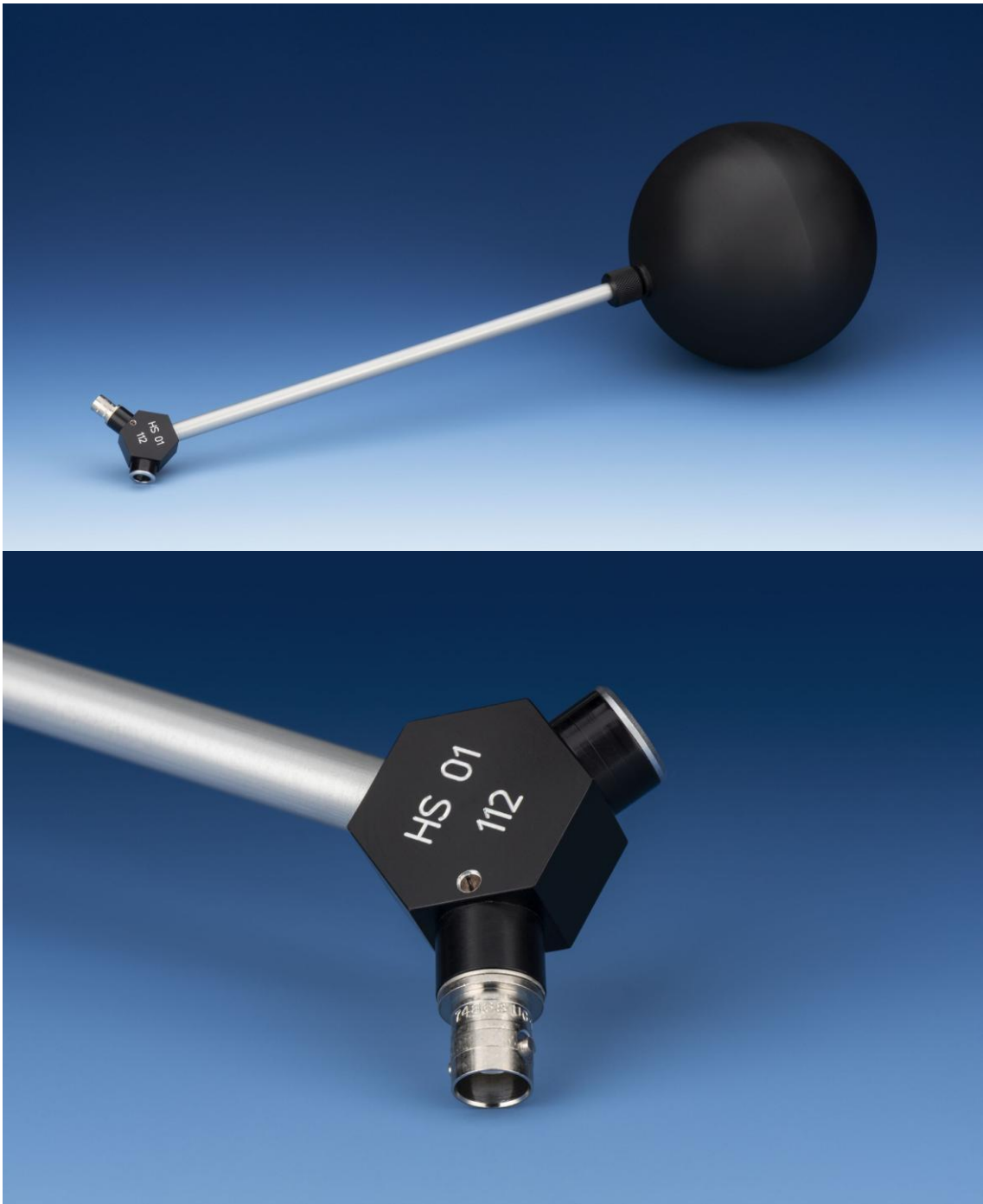
Figure 1: HS01 S/N 112, Secondary standard chamber for H^*(10) (Photo credit Bildstelle PTB).