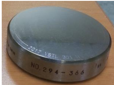
S/N: 294-366, 305 HBW1/30