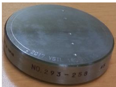
S/N: 293-258, 165 HBW2,5/187,5