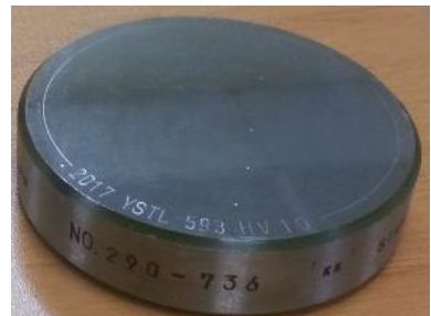
S/N: 290-736, 570 HBW2,5/187,5