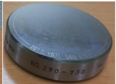
S/N: 290-730, 565 HBW1/30