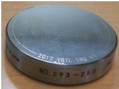
S/N: 293-250, 165 HBW1/30