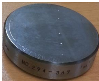
S/N: 294-367, 300 HBW2,5/187,5