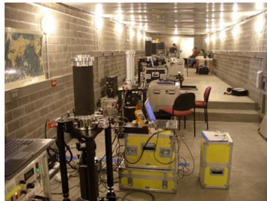
Fig. 1 Picture taken during the comparison of absolute gravimeters in the Underground Laboratory for Geodynamics in Walferdange.

and space requirements to be able to accommodate up 16 instruments operating simultaneously.